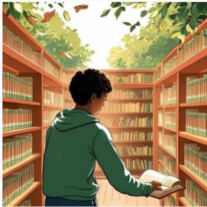
Open Air and Library Search Platforms