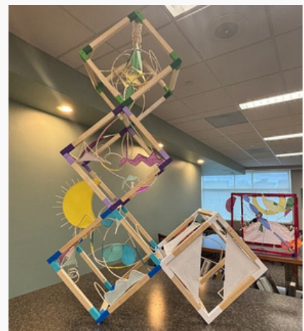
Foundations Art Class