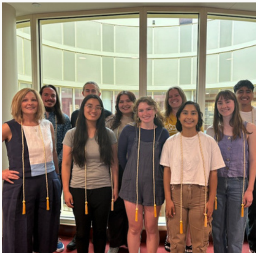
2025 Library Student Employee Graduates

Congrats to all our scholarship winners and graduates.