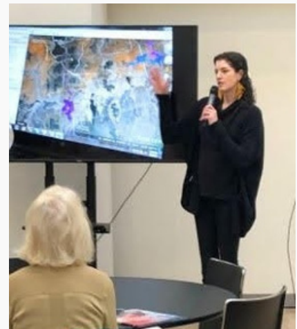
2025 Children's Literature Symposium