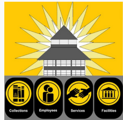
Presentation to the Board of Trustees Academic Affairs Committee