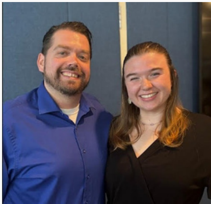
Library Advisory Council Meeting Events Scholarship Luncheon