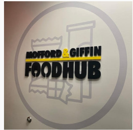
Hickory Campus Food Hub Dedication