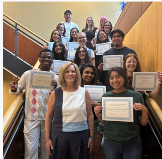
2025 Student Employee Scholarship Recipients