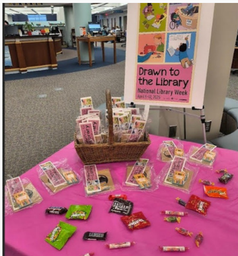
National Library Week