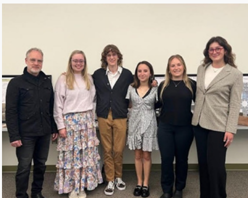
Interior Design Classes