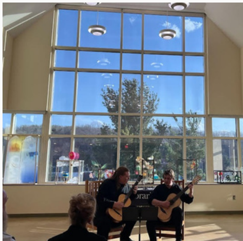
Ophee Collection Guitar Concert