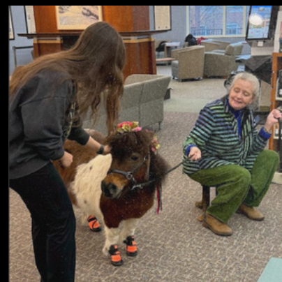
FINALS FEST 2025